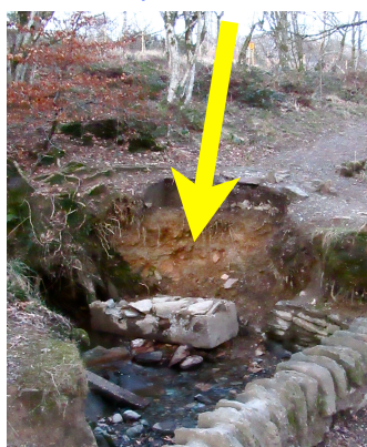
Foundation of old bridge now collapsed into stream.