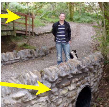
The new culvert-bridge.